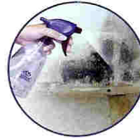
Kill Mold/Mildew Nozzle in stream mode