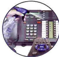
Sanitize Nozzle in stream mode