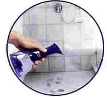
Heavy Stains Nozzle off bottle