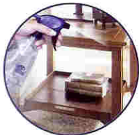
Clean Furniture Nozzle in stream mode