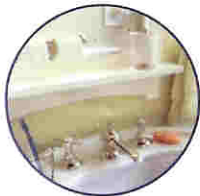
Mirrors/Glass/Chrome Nozzle in stream mode