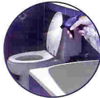
Sanitize Nozzle in stream mode